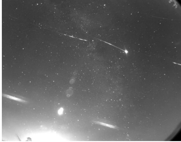
Figure 2. M20160727_022352 fireball spectrum image obtained with spectrograph #1.

shown in Figure 2. Its apparent visual magnitude was approximately -9. It was captured by spectrograph #1 with a 75 second exposure. The effect of the Moon's brightness can be appreciated in the image.