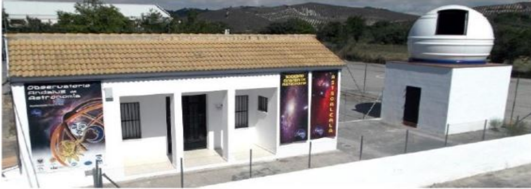
Fig. 3. Eastern view of the OAA main entrance.