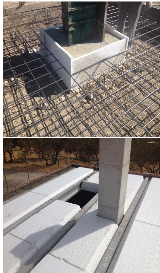
Fig. 2. Detail of the foundation of the pillar and structure. It can be seen how the pillar and its foundation slab are totally isolated from the rest of the structure of the building.

The OAA has been built for a perfect South orientation. In this way it has been possible to construct a sundial oriented towards the South and at the moment we are planning on placing two more on the sides of the building with East and West orientation (Figure 3).